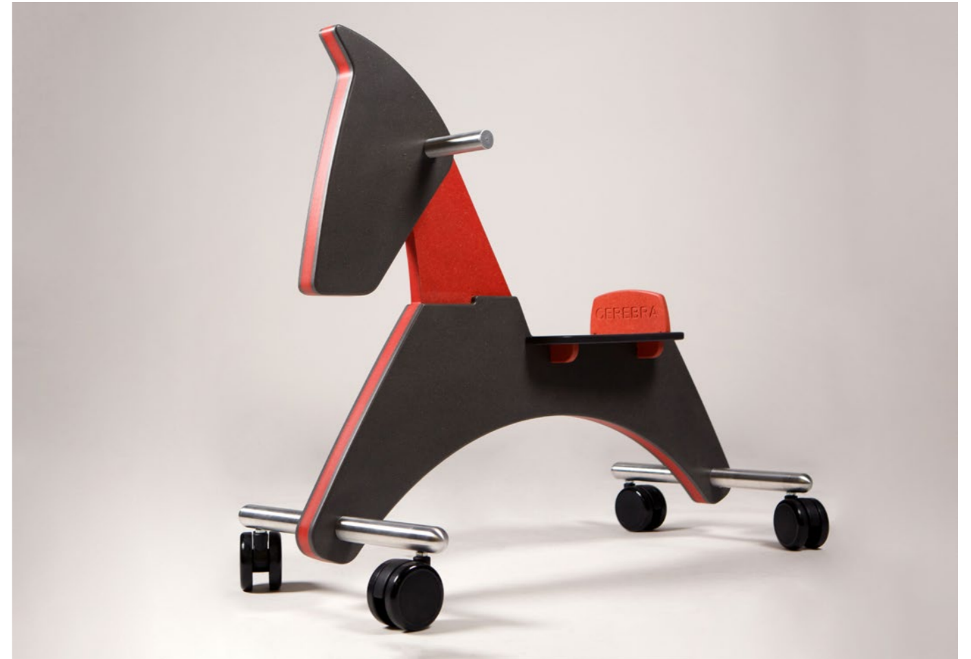
Scoot Horse: "The lads spent most of half term on them and always ask to play on them when they return from school. They're brilliant and definitely their favourite toy! Thank you"