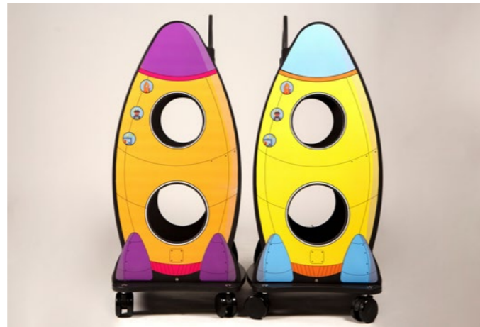
Medical Stands - We have created a fun and colourful alternative to the stainless steel apparatus currently offered to children needing any portable medical equipment such as food pumps or intravenous drips .....