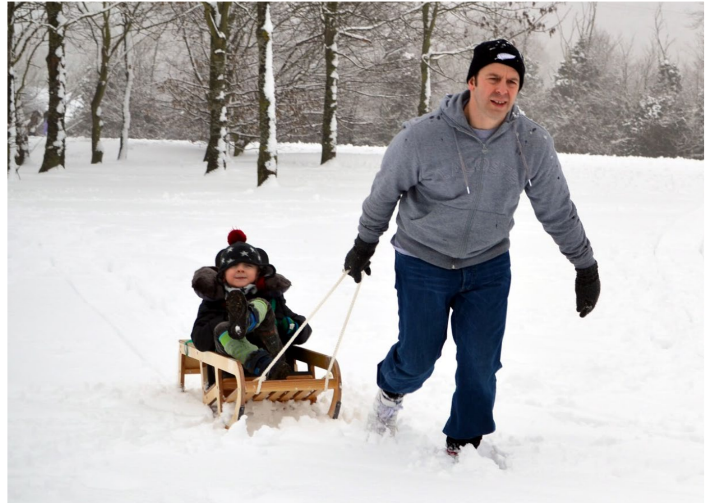
Sledge - "After a deep fall of snow overnight, we have eventually managed to get her outdoors on the sledge, and she loved every second of it, even asking if we could take her out on it every day."