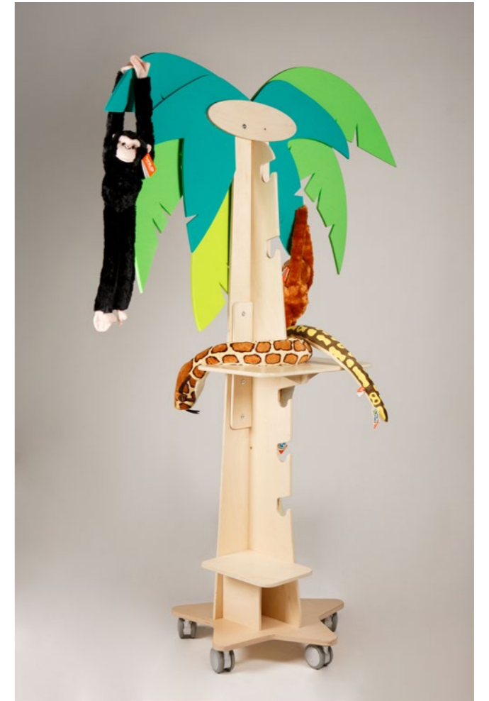
..... So far, we've prototyped a giraffe, rocket, and a tree, but the possibilities are endless! Maybe we should make a dinosaur next?